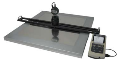
Option for digital type: Printer

* Specifications and design details may be subject to change.