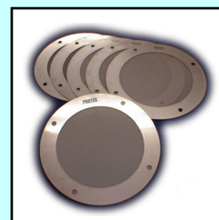
Filters for exclusive use ※Optional item

Please consult us for the size of the container.