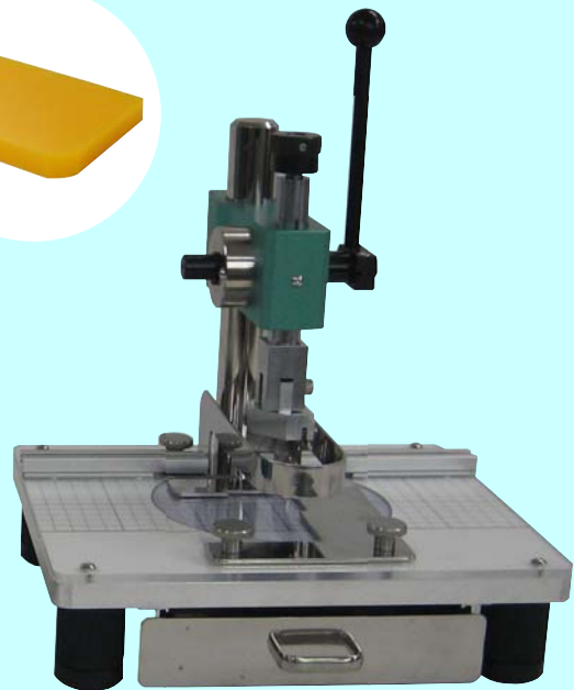
Model : SC-130C Corner R blade type