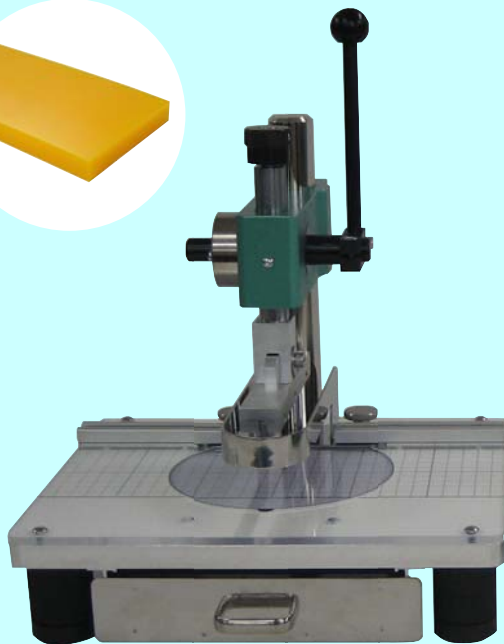
Model : SC-130B Straight blade type